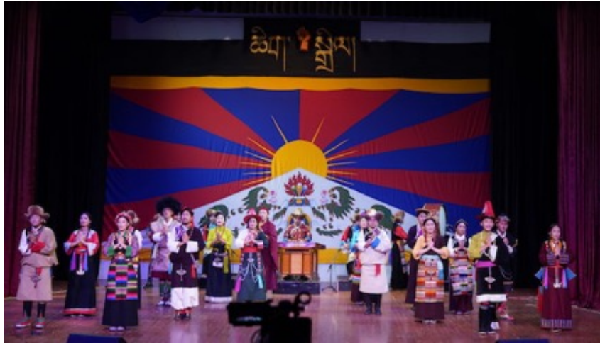
Here are photos of the artists performing at the Festival and members of the winning house celebrating their victory!