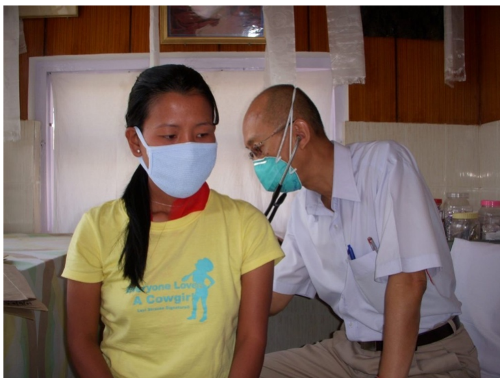
Treating a patient at Delek Hospital

We at Delek Hospital are committed to serve all those who come to us despite their gender, race, religion, country of origin or socioeconomic status. We treat all people in a compassionate and respectful manner, providing them with the finest treatment commensurate with our resources.