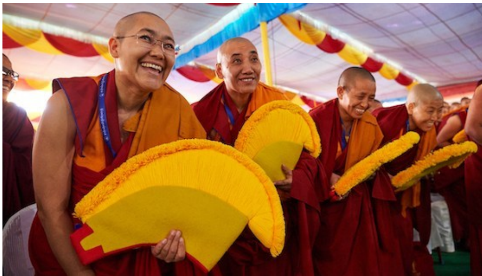
Nuns receiving Geshema degrees

In 2016, twenty nuns made history when they were awarded the Geshema degree. This degree is equivalent to a PhD in Tibetan Buddhist philosophy and was only formally opened up to women in 2012.