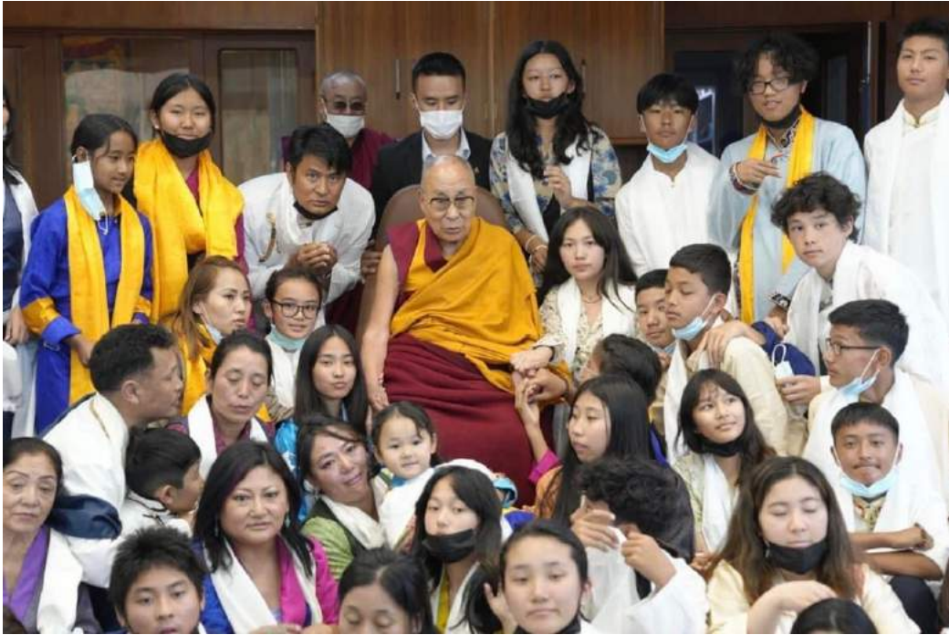
Children from the Tibetan Children's Village welcoming His Holiness the Dalai Lama