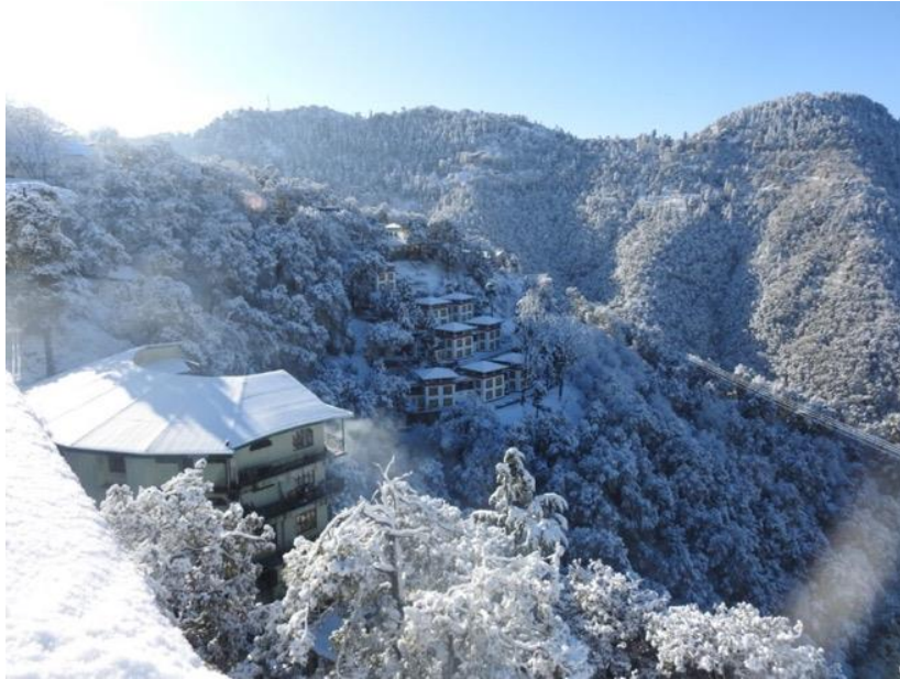
Tibetan Homes Foundation Mussoorie

Built into the sides of steep mountains in the Indian Himalayan region, Tibetan Homes Foundation school in Mussoorie is home to hundreds of Tibetan children, many of whom are far away from their families in Tibet, India and Nepal. While beautiful, the winter months here can be harsh, and the old school buildings are often covered in thick layers of icy snow.